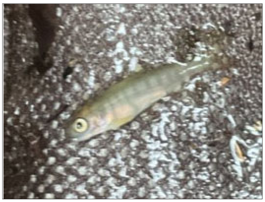
Figure 1.–Juvenile coho salmon captured at waypoint 922.