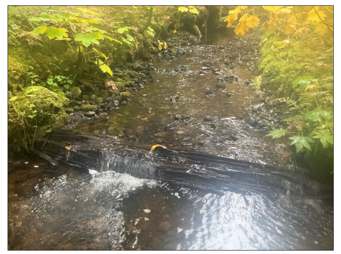
Figure 2.-Channel at waypoint 921.